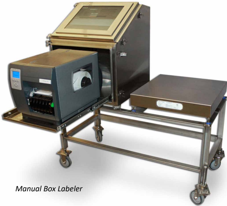
Manual Box Labeler