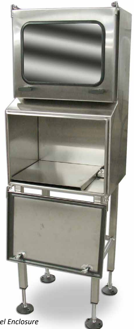
NEMA 4X Stainless Steel Enclosure

Remote Internet support available on many systems!