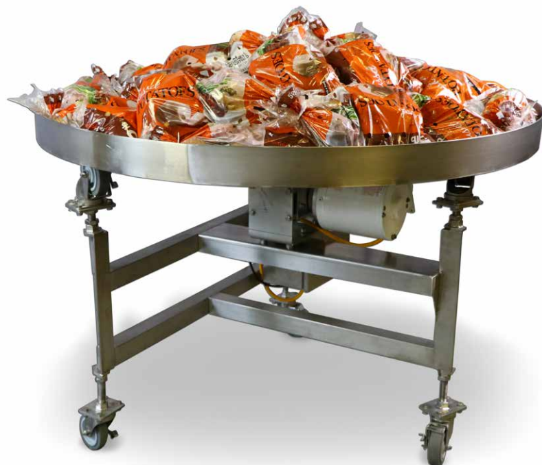
Rotary Accumulation Turntables