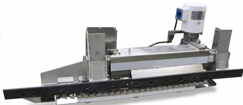
High Accuracy In-Motion Stainless Steel Monorail Scale, Legal for Trade