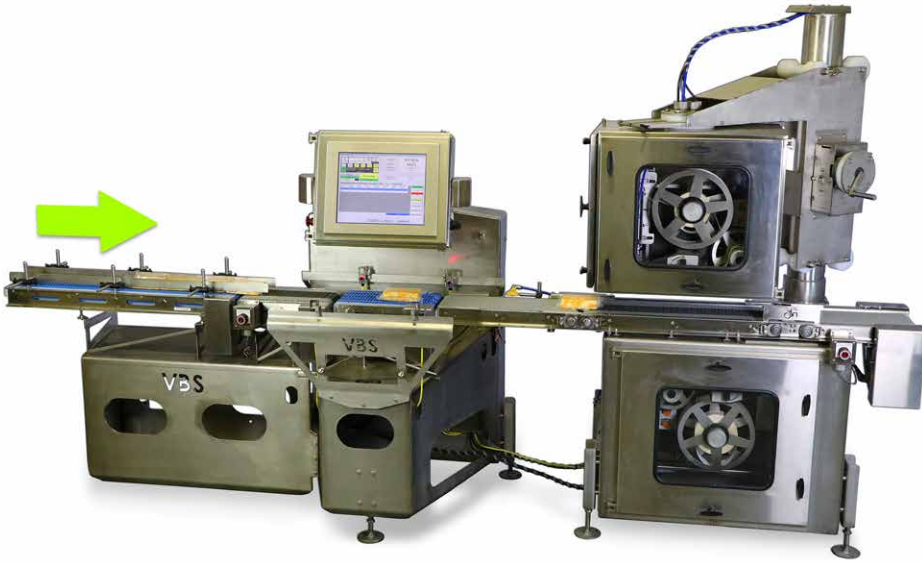
Weigh Price Labeler, Legal for Trade