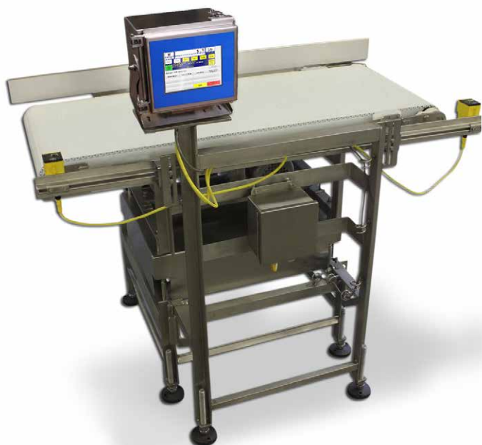
In-Motion Conveyor Scales, Legal for Trade