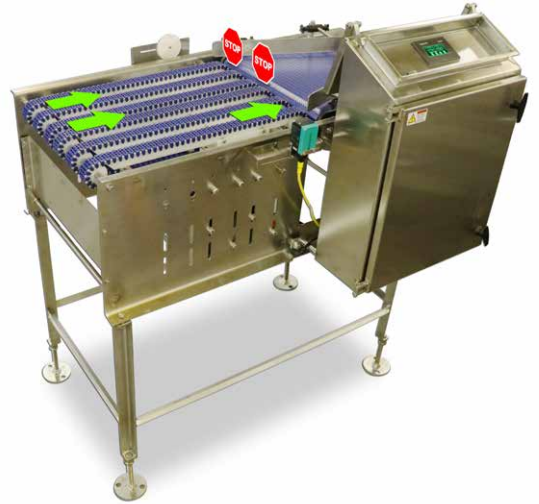
Multi-Lane Singulator Conveyor