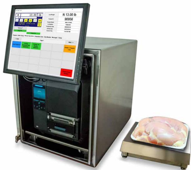
Compact manual labeling