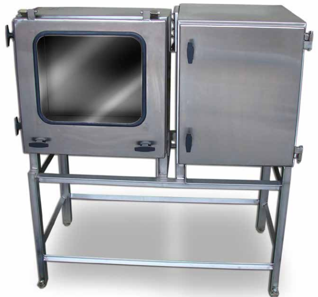
Custom Enclosures & Cart Stands