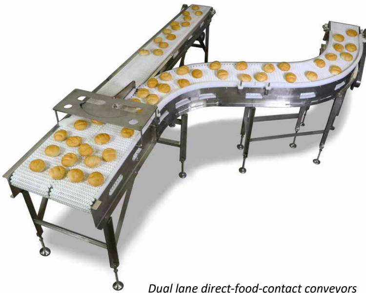
Dual lane direct-food-contact conveyors