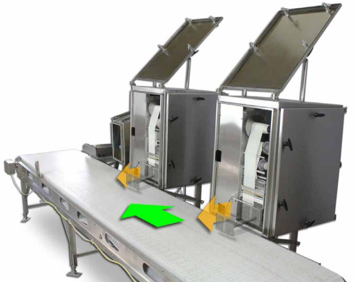
Washdown-Capable Case Labelers in NEMA 4X Enclosures