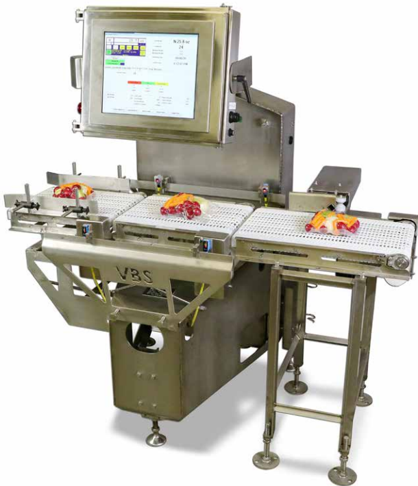
In-Motion Checkweigher with Divert