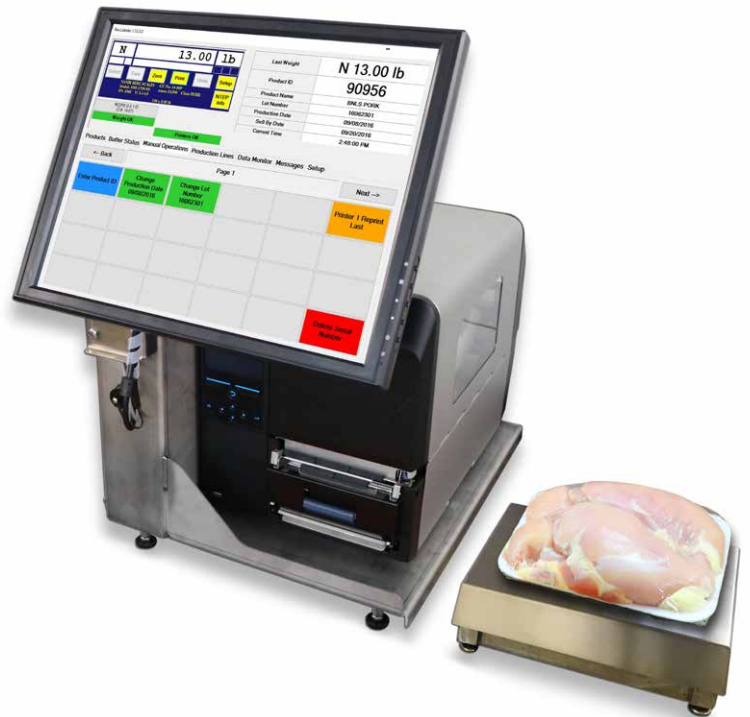
Non-washdown compact manual box labeler with standard small capacity scale. (User mode shown)