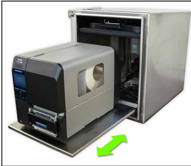
Label printer easily slides out.