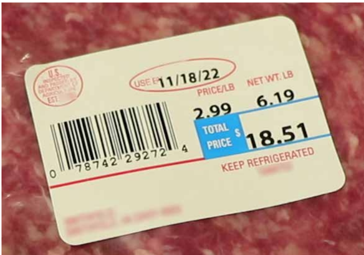
Actual weigh price label on a beef package.

Scan this 2D barcode to see a video on our compact manual box labeling systems