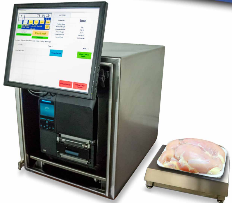
Compact manual box labeler with standard small capacity scale. (User mode shown).