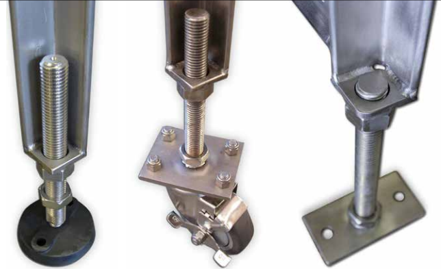
Choose from several types of feet. All are adjustable ensuring a level surface no matter what floor challenges you face.