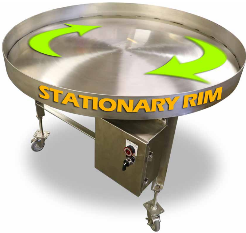
Turntable with a stationary rim. Customer can cut in notches allowing product to be fed directly on to the table's platform.

Scan this 2D barcode to see a video on how this turntable operates!