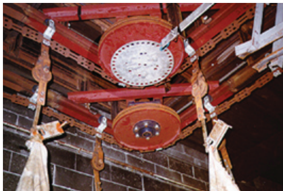
Hide sortation encoder wheel