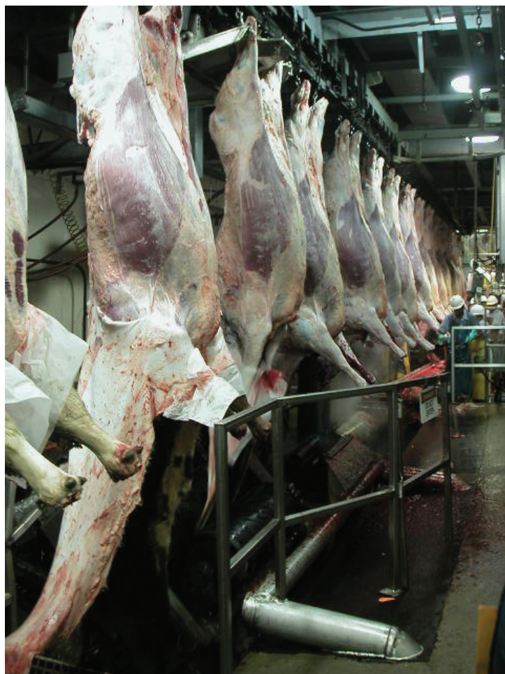
Stripping hides from carcasses.