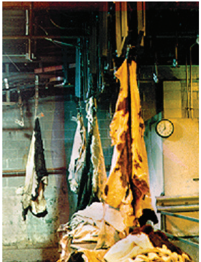
Hides being sorted