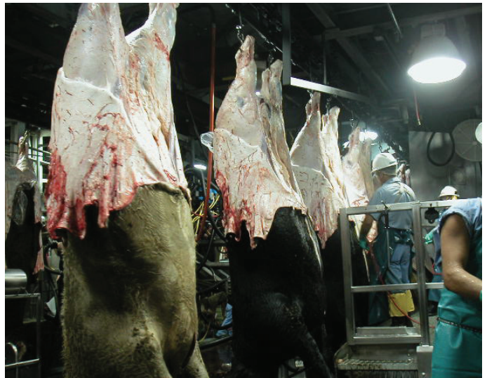
Beginning the process of removing the hides