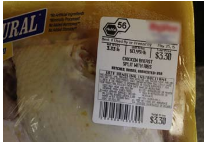
Whole chicken breasts labeled with a manual weigh price labeler.