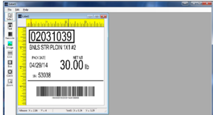
Included software permits complete customization of label layout. Software can be installed on a host and pushed out to each unit, if desired.