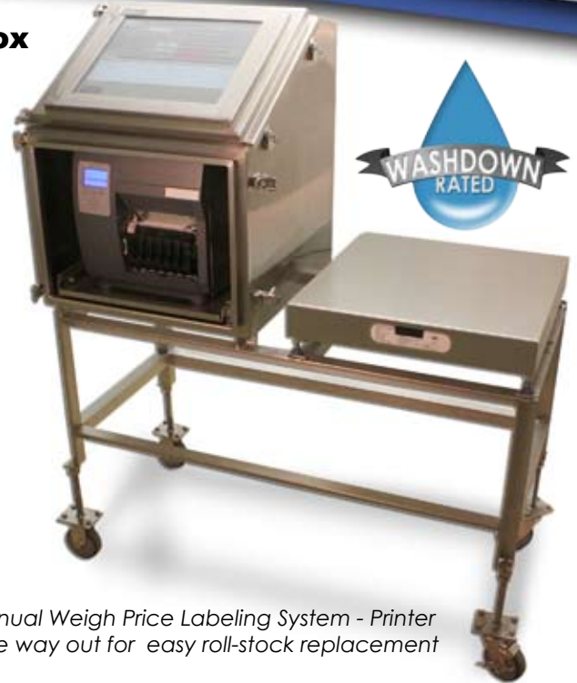
Mobile Manual Weigh Price Labeling System - Printer slides all the way out for easy roll-stock replacement

Handle diverse production runs and unique line requirements easily with our compact manual weigh labeler. NEMA-4X construction ensures complete washdown compatibility when doors are closed.