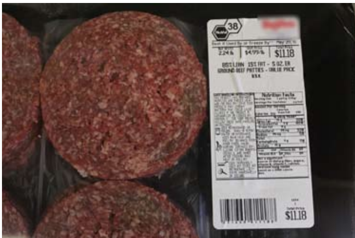
Hamburger patties labeled with a barcode weigh price labeler