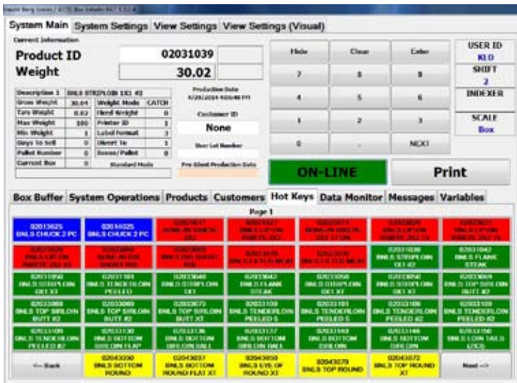
Example of a software interface with colored hot-keys for quick label selection and printing.