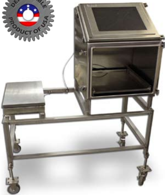
Mobile Manual Weigh Price Labeling System with human machine interface with a NEMA-4x enclosure.