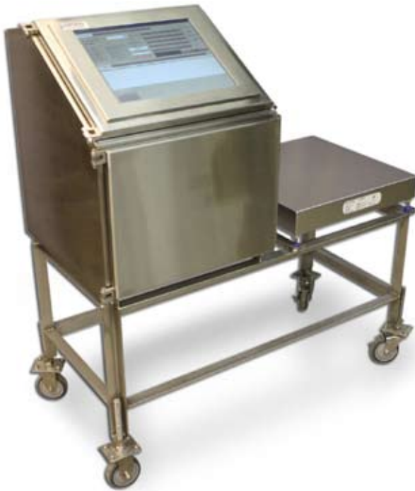
Mobile Manual Weigh Price Labeling System with human machine interface with a NEMA-4x enclosure.