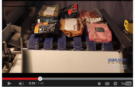
Click to see a YouTube video of our Singulators!