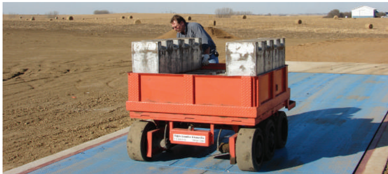
Scale certification process using certified weights and cart

The heavyweight of scale certification test trucks in the 4-State region