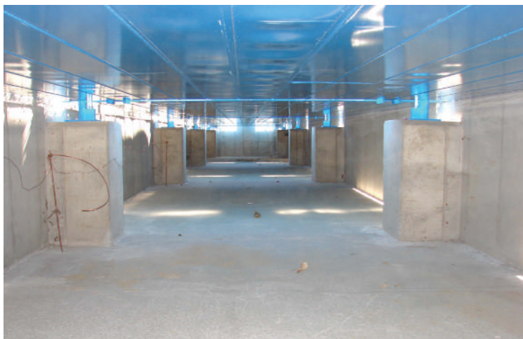
This pit offers easy access to walk around in for cleaning.