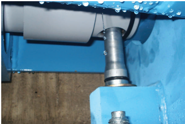
Weightbar & Stand

Ask about our line of indicators, remote displays, printers, stands and more!