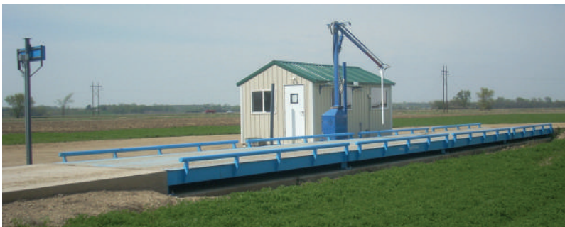
Pitless scales are available with a long-lasting metal deck including side rails

VANDE BERG S C A L E S Division of VBS, Inc.