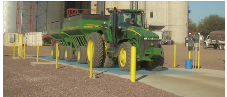
Pit truck scale including remote printers

VANDE BERG S C A L E S Division of VBS, Inc.